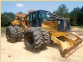
04 Deere 748GIII - Call