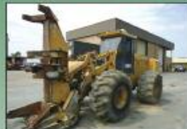
S/N 882056, 9076 hrs, F022/29L, $42,500