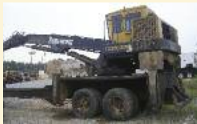
TK560 T06602471 .....$35,000 8430 Hours, Equipped with ROPS cab and A/C, front screen, 5055 tW R50 360 grapple, CTR 426 delimber, mounted on D48HD Evans trailer, tires approx. 30%