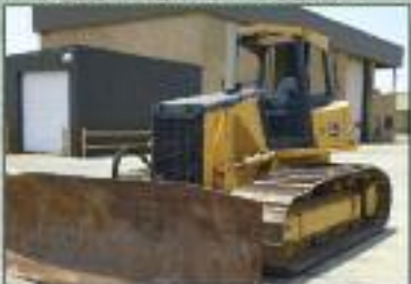
S/N 144966, New U/C, 3713 hrs. $98,000