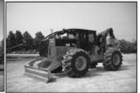
2010 Cat 525C S/A 829 hrs, warranty $190,000