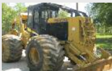
2005 Prentice 490 Skidder – 6,200 hours, Dual Arch, Very good 43 floatation tires, cab with air, winch, Clean! .....$59,500