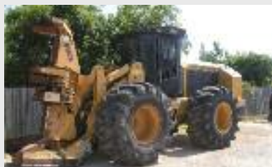
2007 Cat 573 Feller Buncher - 225 HP, Waratah FD22 Saw Head, very good 30. x 32 tires, cab with air .....$CALL$