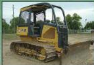
S/N 140374, 2441 hrs.....$57,000