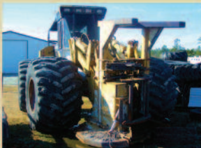
96 HydroAx 611EX $29,500