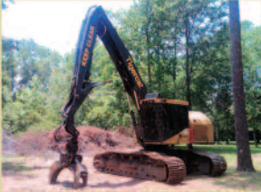
06 Tigercat 860C $179,500