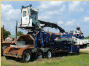
1998 PE 5000G $75,000