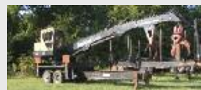
2004 Timberking TK540 / Prentice 280 Log Loader – 5,035 hours, Prentice continuous rotating grapple, Cab with air, Trailer mounted .....$59,500