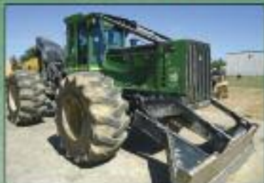
S/N 623453, 3807 hrs.....$98,000