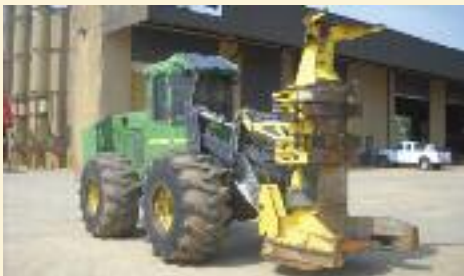
843J T09106230 .....$115,000 4985 Hours, Equipped with ROPS and A/C, FD22B Deere head, 28L-26 tires, Front tires approx 80%, Rear tires approx. 20%