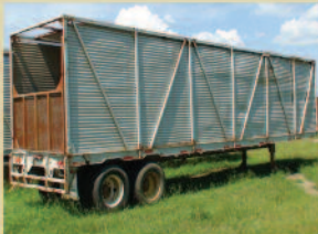
97 Olvedi Chip Vans $4,900