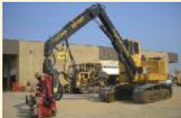
H250B T1105440 .....$162,500 6603 Hours, Equipped with ROPS high-rise cab and A/C, Waratah processing head model HTH 622B, S/N 622380, 30" Track Pads