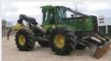
2007 John Deere 648G-III – 5,200 hours, 30.5 x 32 tires, cab with air. ....$89,500