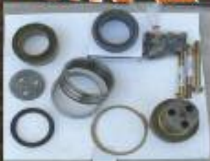
Center Section Kits For John Deere