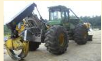
648H T08173101 .....$CALL 6423 Hours, Equipped with ROPS cab and A/C, side screens, grapple, winch, decking blade, 30.5L-32 tires, front tires approx. 50%

VISIT OUR WEBSITE OR CALL US FOR MORE INFORMATION ON MORE OF OUR QUALITY USED EQUIPMENT