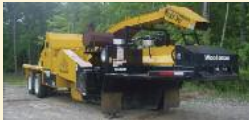
337 CHIPPER T12410550.....$252,500 811 Hours, Equipped with a Cat C15 HP engine, 24"x38" throat, opening, 37.5x48" wide drum, (8) 12" long x 6" wide x 5/8" tick single edge Babbitt knives, (4) 11R24.5 tires