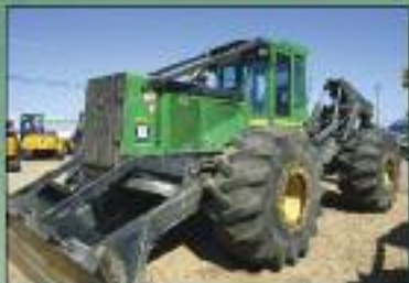
S/N 623874, 3515 hrs.....$160,000