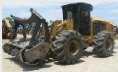
2007 Cat 573 Mulcher – FAE 300 Mulching Head, High pressure pump, 28L tires, Cab with air. ....$CALL$