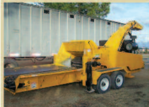
06 Woodsman 334 $126,500