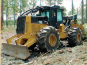
09 CAT 525C $142,500