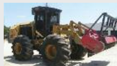
2004 Hydro-Ax 470 Mulcher - Fecon BH120 Mulching Head, New Cummins engine, 28L tires, Cab with air .....$119,500