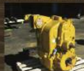
Ready to Go! Fits 648G2 & 648G3 Direct Drive Transmission