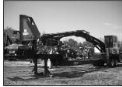
2005 Prentice 410E CTR 426 del, Pitts trailer $80,000