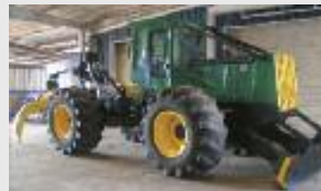
2003 Timberjack 460D Grapple Skidder - Dual arch, Winch, Cab with air, 30.5 x 32 tires.....$59,500