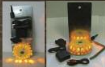
Rechargeable Log Light Kits!