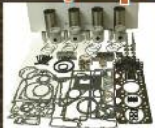
Engine Overhaul Kits