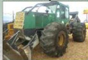
DF/30/30.5.....SALE PRICE $50,000