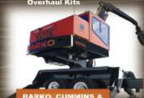
BARKO, CUMMINS & ROTOBEC Parts!