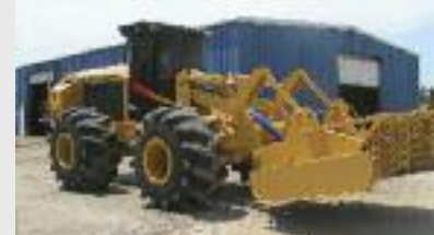
2002 Hydro-Ax 570 Mulcher - Rotary Ax Mulching Head, Cummins engine, 34:00 tires, Cab with air .....$CALL$