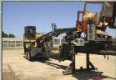
S/N 011248, KB45-D/CTR 450...$72,000