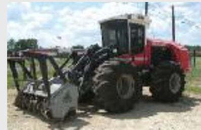
2007 Prentice 2470 Mulcher - FAE 200 Mulching Head, High Pressure pump, 28L tires, Cab with air .....$CALL$