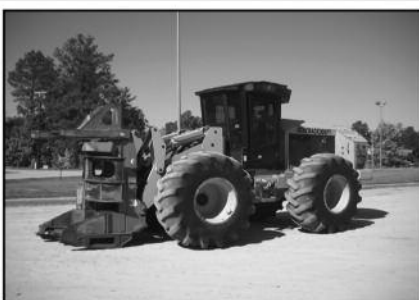
2008 Cat 563 22HC saw $135,000

We also BUY Used Recycling & Forestry Equipment