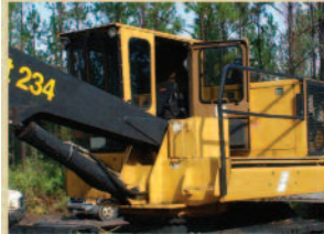
07 Tigercat 234 - $79,500

Brian Nielson (Cell) 803.960.1613 | Jesse Sewell (Cell) 803.807.1726