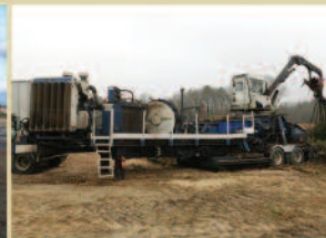
Peterson 5000G & H Chippers