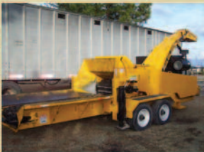
06 Woodsmen 334 - Call