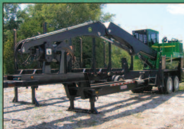
2008 Deere 437C