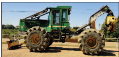
2006 John Deere 648GIII .....$55,000

5700 Hwy 49E • Yazoo City, MS 39194 www.stricksequipment.com 662-746-8380