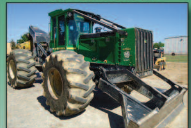
2006 Deere 648GIII