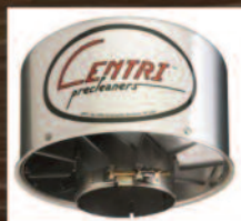
Distributor for CENTRI Pre-Cleaners!