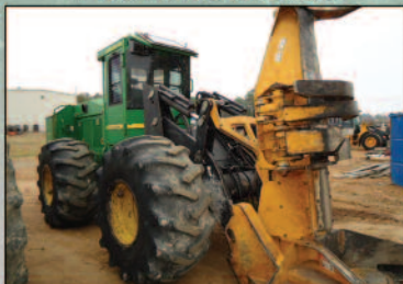
2009 Deere 643J