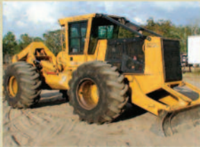
07 Tigercat 620C - $89,500