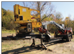
2005 Prentice 384, CSI delimeter .....$45,000