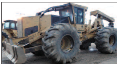
2007 Tigercat 630C .....$70,000