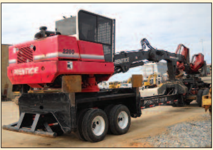
2280 T08635941 .....$110,000 3652 hours, Equipped with ROPS cab and A/C, front screen, 360 grapple, CTR 426 delimeter, mounted on Evans trailer, tires approximately 50%

VISIT OUR WEBSITE OR CALL US FOR MORE INFORMATION ON MORE OF OUR QUALITY USED EQUIPMENT