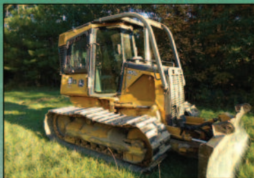
2005 Deere 650JLGP