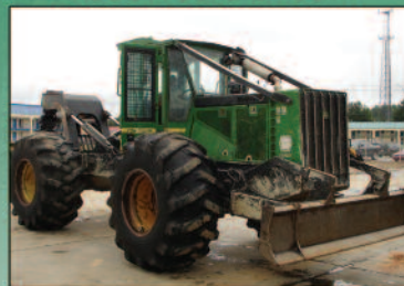
2006 Deere 648GIII