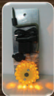
Three Rechargeable Log Light Kits available!