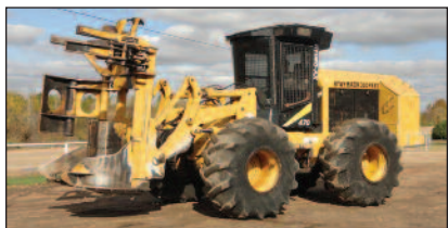
2006 Hydro-Ax 470.....$47,500