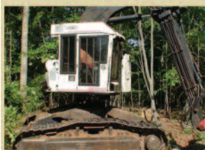
02 TI 445D w22" Saw, Nice!