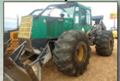
2001 Timberjack 660D