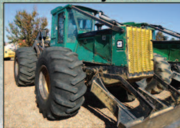
2002 Timberjack 460D