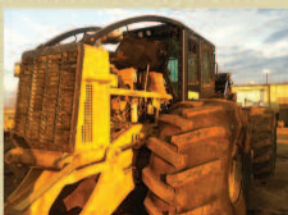
2008 CAT 545 - $119,500