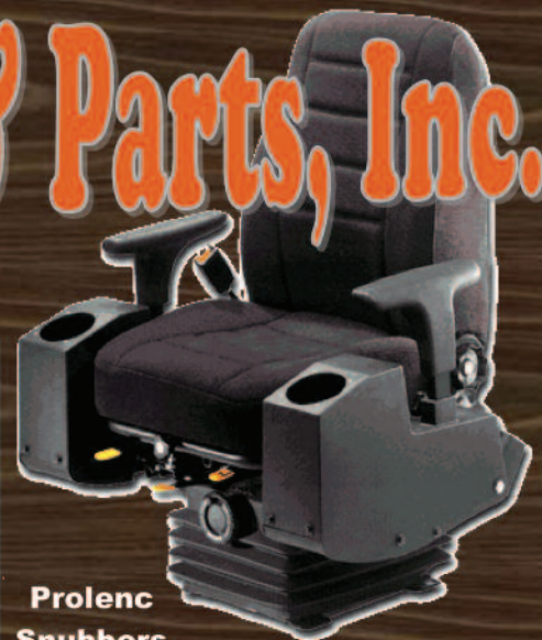
New Joystick & Mechanical Seats