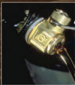
Oil Drain Valves