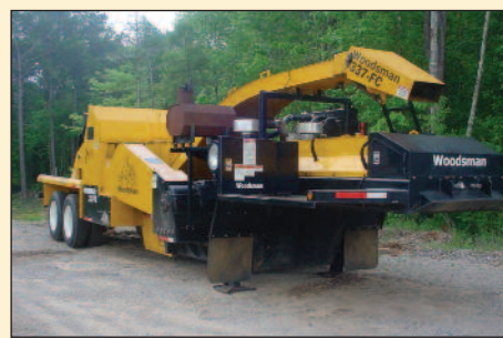
337 Chipper T12410550 .....$242,500 811 hours, Equipped with a Cat C15 HP engine, 24"x48" throat, opening, 37.5x48" wide drum, (8) 12" long x 6" wide x 5/8" thick single edge Babbitt knives, (4) 11R24.5 tires