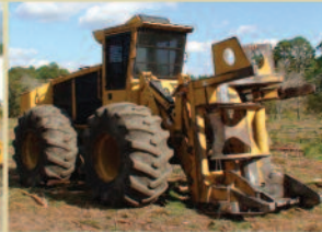
06 Tigercat 720D - Call