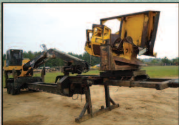
2005 Deere 437C