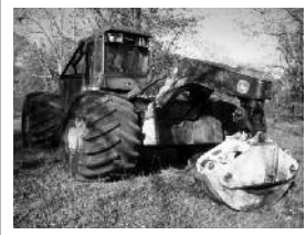
2007 John Deere Skidder 648 GIII $65,000 43x66 Tires, A/C, heat, new transmission, 8900 hours