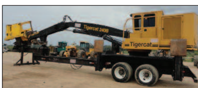
2005 Tigercat 240B, CSI delimeter, super nice!.....$55,000 video available