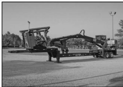
2006 Cat 559 Riley 4800C delimeter $105,000

Your Recycling & Forestry Used Equipment Source