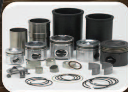
OEM & AfterMarket Overhaul Kits