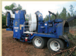
08 Peterson 5900 w4500 hrs