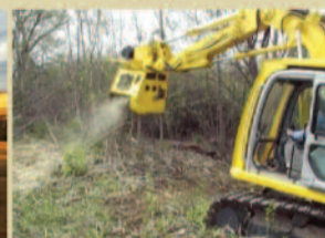
Sneller 170 w300 hrs - $65,000